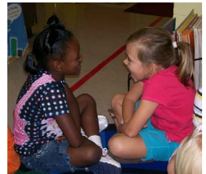
Children working in a dyad

To learn more about West High School, TCN, and all the schools we serve, click here .