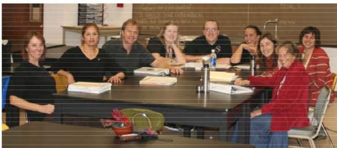
PassageWorks staff consult with teachers at West High School