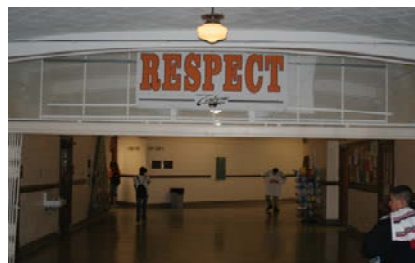
West High School, Denver, CO.

The predominant educational research of today emphasizes that students succeed when teachers and other adults set high expectations, create meaningful opportunities for involvement, AND genuinely care for young people. The Bill and Melinda Gates Foundation with the partnership of the federal government, have synthesized these principles into the "new three R's" — Rigor, Relevance, and Relationship. Drawing on the linkages between these components of education has been a foundation of the PWI model for decades, and we are thrilled to continue to build on this alignment with teachers, schools, districts, funders, and policy makers from across the country.