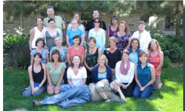
Creating Engaged Classrooms Boulder,CO June 2012

Who we are and the environment we create in class are at least as important as the teaching skills we possess. —Rachael Kessler