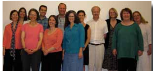
Educators with Contemplative Practices April 24, 2012