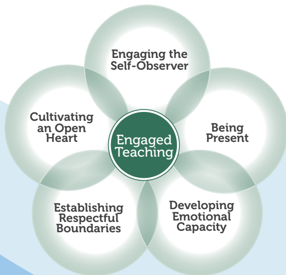
Five Dimensions of Engaged Teaching

The source material for The Five Dimensions of Engaged Teaching comes directly from the wisdom, intelligence and experience of hundreds of educators and has been gathered through interviews, focus groups, dialogue groups, surveys and action research. In this way, the book is an expression of the field of education speaking back to itself. The Five Dimensions of Engaged Teaching offers practices and principles for 1) developing and sustaining a reflective teaching practice 2) integrating social, emotional and academic learning, and 3) developing a positive school-wide culture. The principles and practices articulated in the book form the core of the Institute’s work with educators. For up to date information about our work, click “like” on our facebook page and follow us on Twitter.